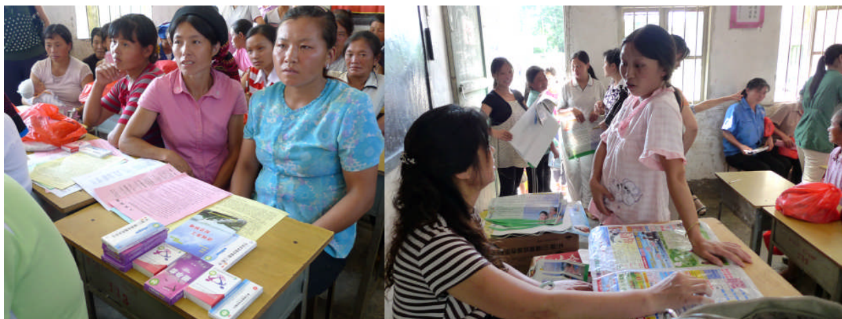
The first health-training workshop occurred in June 2009.