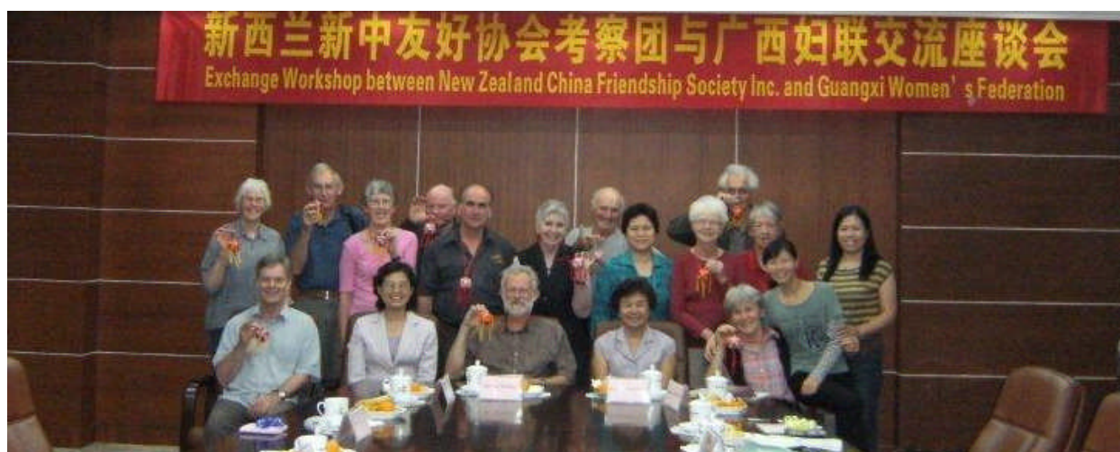
Last year's Tour was welcomed by the Guangxi Women's Federation in Nanning