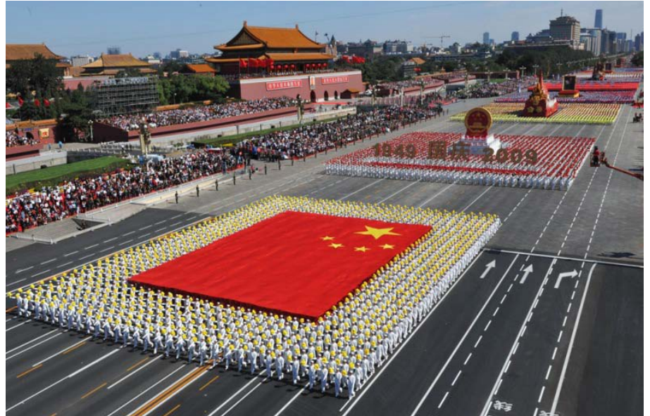
The parade for the 60th anniversary of the founding of the PRC.

Firstly came representatives of the various military units marching on foot in impeccable unison, followed by 30 different squadrons, usually of 18 vehicles each, from tanks, to missiles, to armoured cars, driven in the same precision as the marchers. Overhead flew groups (flocks?) of varying types of Chinese-made war planes from huge airlifters to helicopters. These were followed by 50 floats (or was it 60, for many things were of this number during the celebrations), representing areas of industry, agriculture, education, medicine and other areas of progress plus floats representing each province and region, including Taiwan.