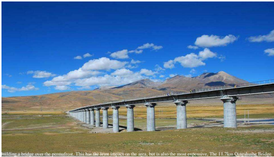
Building a bridge over the permafrost. This has the least impact on the area, but is also the most expensive. The 11.7km Qiyehuibe Bridge.