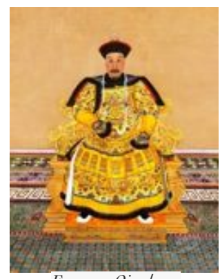
Emperor Qianlong Qing Dynasty (1644–1911) National Museum of China

The exhibition showcases a stunning selection of rare cultural treasures, including two thousand year-old silks and precious gold vessels and will not be seen anywhere else in the world.