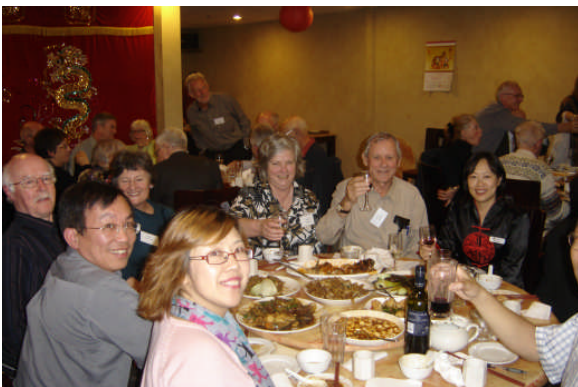
Bottom Right: The new National Executive including Branch Presidents.