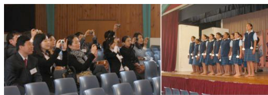
The welcome powhiri at Nelson Intermediate

The group's final activity was reporting on their future plans, and building them into a 'new wall'. Here they celebrate their successes.