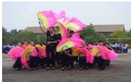
Fan dance at opening ceremony for Sports Day at SBS

Rewi's Tower "Lei Tai" – the historic home of Rewi Alley in the Shandan Bailie School grounds – has been put to good use this week, as the centrepiece and grandstand overlooking the exercise grounds. The sports event stretches over 4 days, Friday to Monday, and, in typical Chinese fashion, the official "weekend" has been moved, so I think that the following Tuesday will be considered to be a Saturday... Timetabling here is never simple!