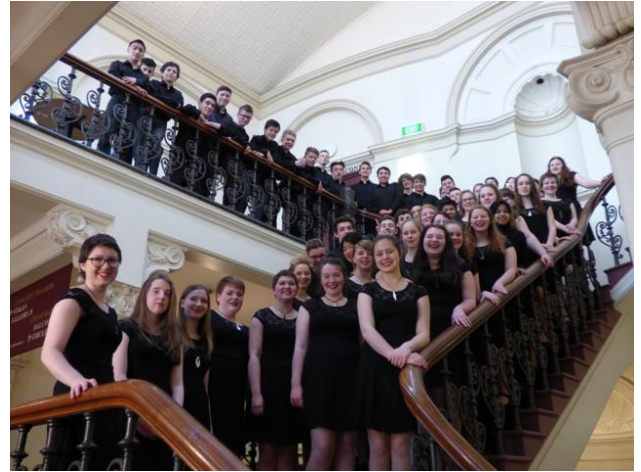
Barock at 2014 "Big Sing" in Auckland.

Members of the Dunedin Branch of the NZ China Friendship Society and the Dunedin Shanghai Association have been encouraging and supporting Barock's endeavors to participate in the 2015 Choral Arts Week of the Shanghai Spring International Music Festival. In November they received confirmation of their welcome to participate in the festival in May this year. They have already been given financial support from NZCFS – Simon Deng Li and Rewi Alley Friendship and Exchange Funds. As well their performances in the SSIMF, the Barock students will also spend time in their sister schools Number 8 High School (OBHS) and Guangming High School (OGHS).