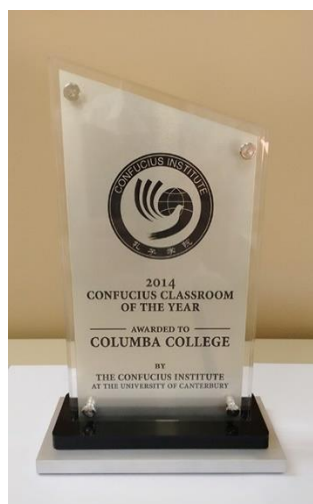
Columba College 2014 S.I. Confucius Classroom of the Year

There will be an end of course celebration on Aug 6