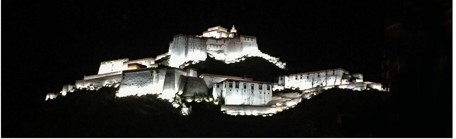
Monastery at Gyantse