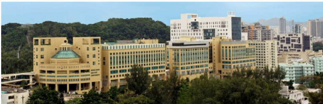
Hong Kong Baptist University, Kowloon Tong Campus