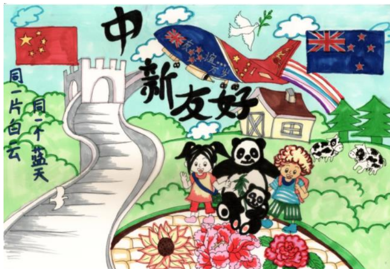
A child's picture from Shangrao, Jiangxi Province, China celebrating Rewi Alley and the 50th Anniversary of China-NZ Relations

Tauranga Branch members are working hard preparing for the Society's National Conference to be held in Tauranga during the weekend of 19–21 May. A comprehensive programme has been developed for attendees and we are looking forward to welcoming members and friends from all around New Zealand, from Australia and from China.