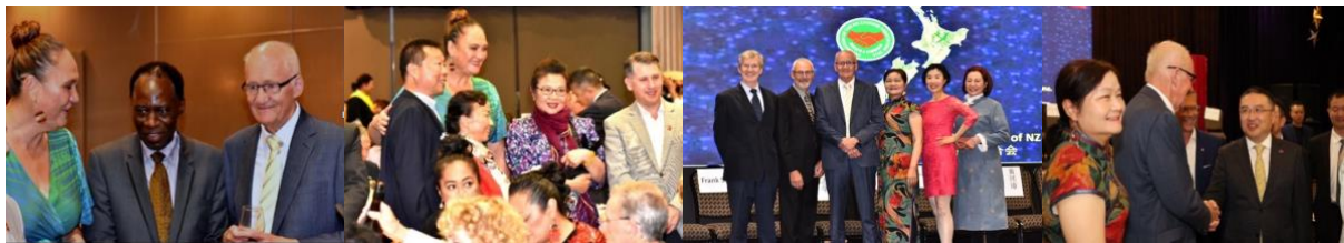
Deputy Prime Minister & Fungai Mhlanga