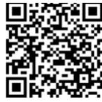
Our Home Page