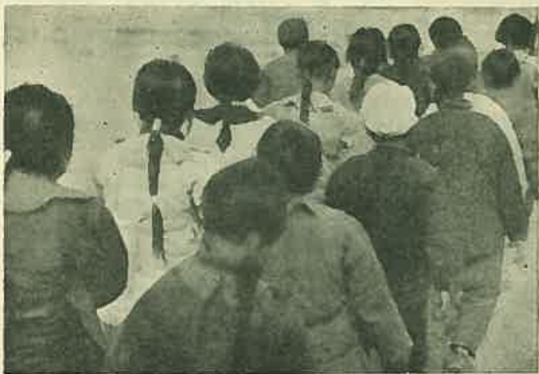
FORWARD TO THE FUTURE

As in the other children's work under the China Defence League, the annual deficit is made up by the Border Region Government.