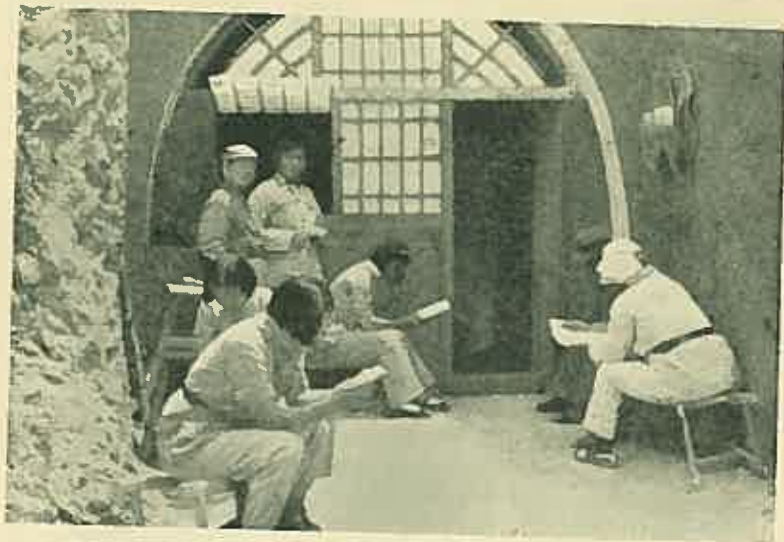
CAVE LIBRARY — TEXT BOOKS ARE RARE, CAREFULLY PRESERVED

ates of the Southeast Shansi Branch of the Yen-an Medical University. The branch was established four years ago, and like the University, has the highest standards of all schools in the guerrilla regions. Doctors fully qualified by international standards are graduated, as well as nurses and military surgeons. A full five-year course of theoretical and practical training is given. Recent reports indicate that there are about 100 students now in training. All International Peace Hospital doctors teach at the school and students do their internship at the hospital.