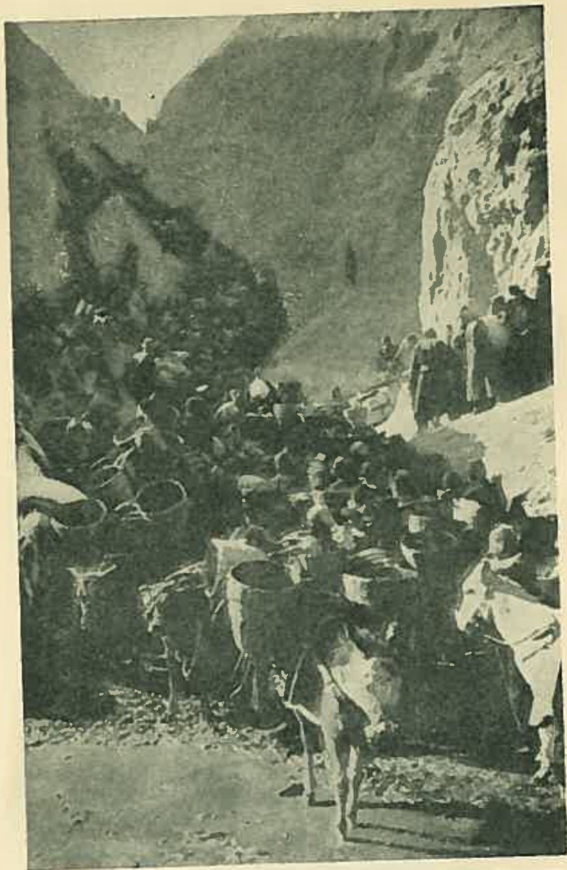
REFUGEES — AS FAR AS THE EYE CAN SEE