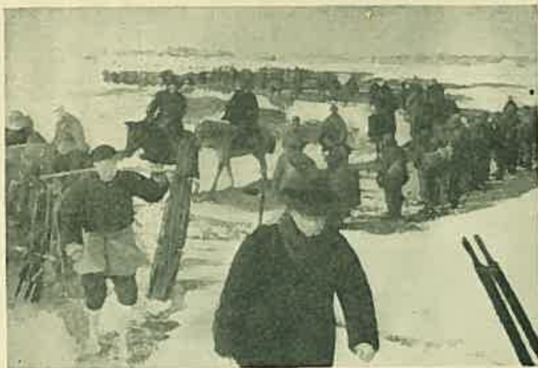
GUERRILLAS ARM THEMSELVES BY CAPTURING ENEMY SUPPLIES

the Committee for Medical Aid to China of Victoria, B.C., the Vernon, B.C. Committee for Chinese War Relief, the Chinese Patriotic Association of Aruba, Netherlands West Indies, and after some delay the China Campaign Committee in London. The encouragement afforded by these organizations during the trying days that followed the fall of Hongkong infused the League's work and its projects in the field with new life and gave confidence to those in charge.