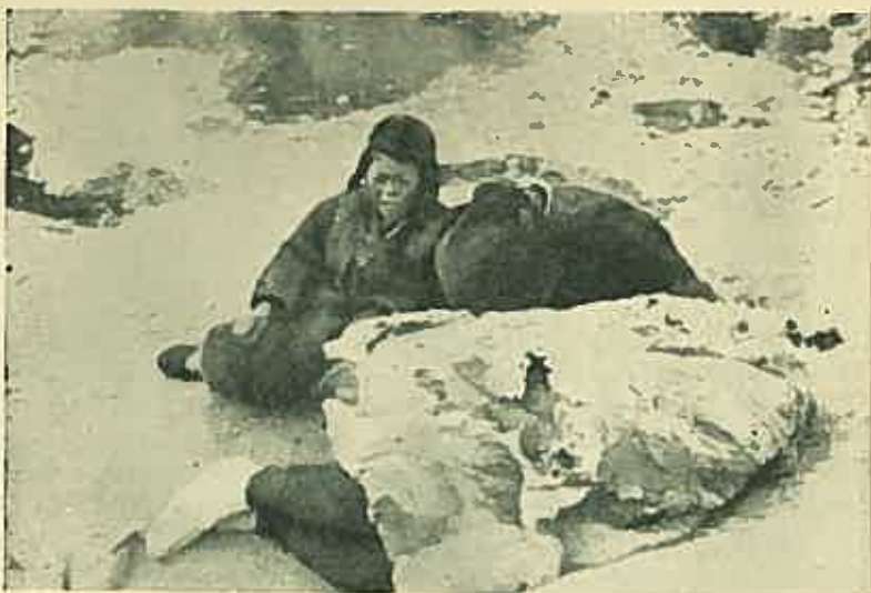
TOO LITTLE AND TOO LATE

ance to the enemy by creating a vacuum into which the Japanese could easily make a drive. Furthermore, additional thousands of refugees began pouring into the districts from the surrounding enemy-held and unoccupied areas, imposing even greater burdens on the war-impooverished, hunger-stricken guerrilla sections of Honan.