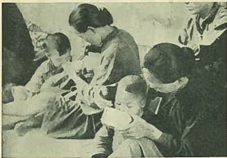
THEIR LIVES WERE SPARED

Going on from these individual cases to the general standard of living in the Region, the report adds: "Formerly the peasants ate only two meals of millet and husks a day, but now they have three meals daily, eat meat three or four times a month and have plenty of vegetables. Formerly a padded garment was worn six or seven years until it could be patched no more. Now peasants can afford a padded suit and two summer outfits yearly." The report concludes: "There is not, and has not been for the past few years, a single beggar in the whole of the Border Region." In contrast to other parts of China, the absence of beggars in the towns and countryside of the Border Region very greatly impressed foreign visitors who passed through the area in 1942 and 1943.