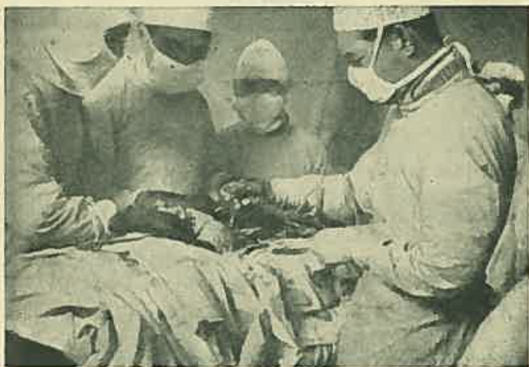
OBSTETRICAL WARD: CAESAREAN IN PROGRESS