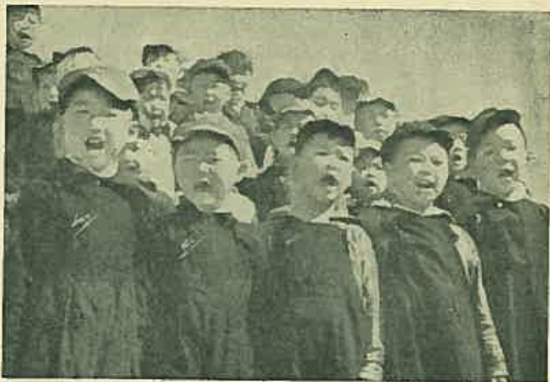
"CHEE LAI, CHEE LAI"