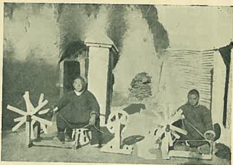
SPINNING COOPERATIVE — CLOTH FOR FIGHTING GUERRILLAS

ing war goods. The loss was weathered, however, and the cooperatives continued their high productive level.