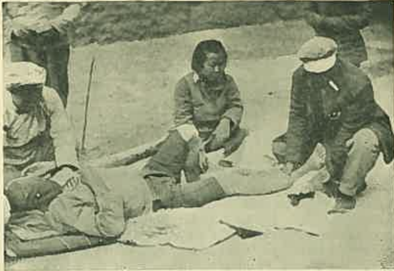
"DOCTORS GO TO THE WOUNDED"

pitals, a day's march or more away, are always accompanied by a trained nurse. Women's organizations along the line of march provide food and drink for both wounded and bearers."