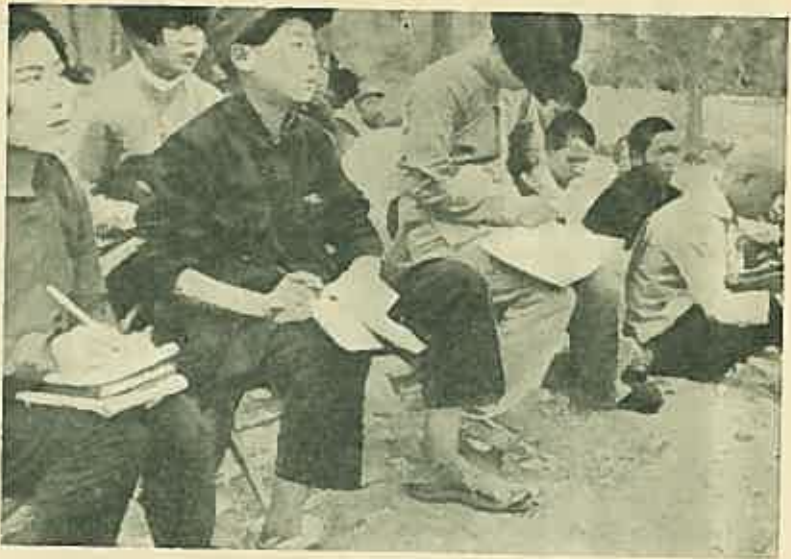
AS THEY LEARN SO SHALL THEY TEACH

20-week terms a year and 20 hours of classroom work a week. Practical work in agricultural stations and technical workshops begin in the second year, half of the daily work being devoted to it. The following subjects are offered: Chinese, English, mathematics, geography, history, biology, botany, chemistry, physics, social sciences, drawing, music, and physical training.