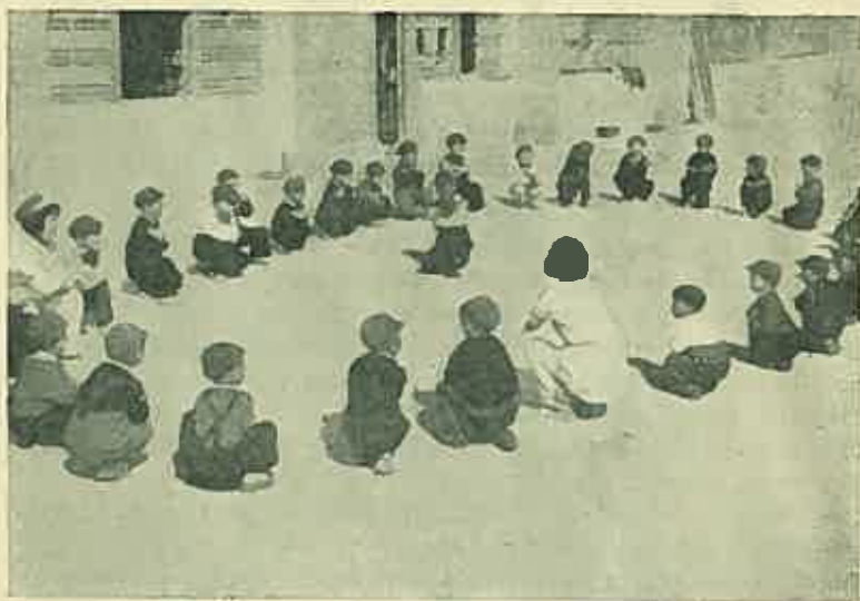
FREEDOM OF MOVEMENT