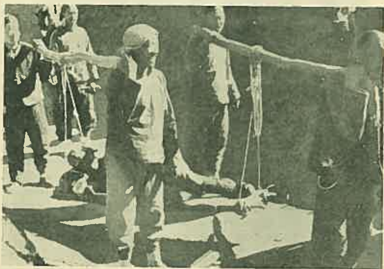
VOLUNTEER PEASANT CORPS SERVES AS AMBULANCE UNIT