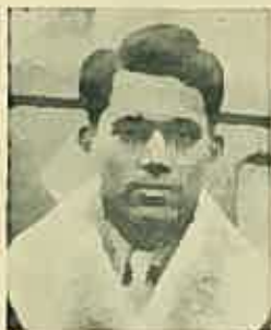
DR. DWARKANATH KOTNIS