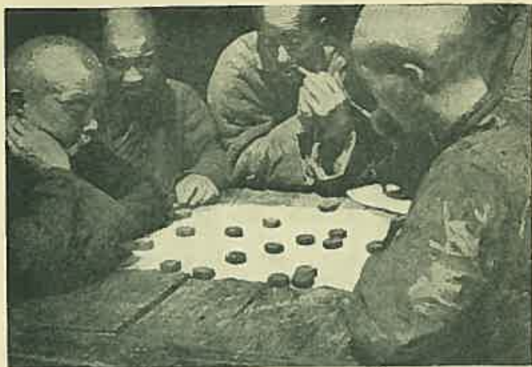
BETWEEN MILITARY ENGAGEMENTS

previous difficulties were aggravated by a famine of horrifying dimensions. In Honan an estimated five million people perished, and in Kwangtung, additional millions were affected.