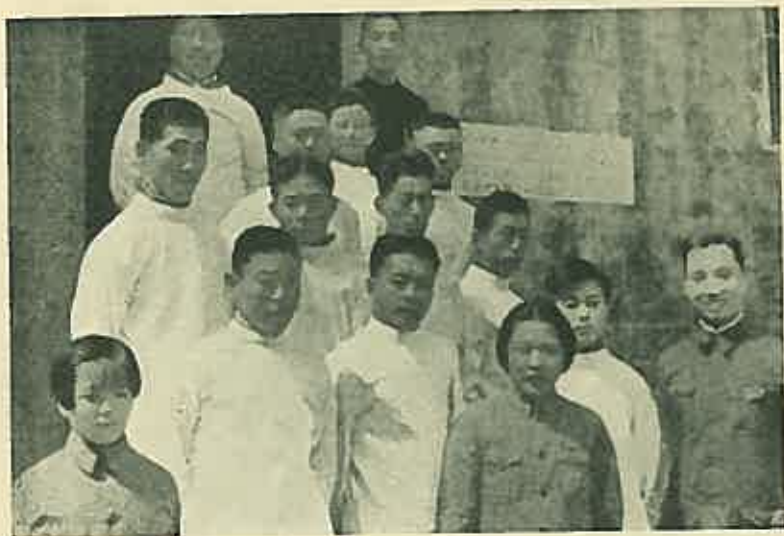
SENIOR STAFF — BETHUNE INTERNATIONAL PEACE HOSPITAL

The fourth branch of the International Peace Hospitals is located in Northern Kiangsu, but since the outbreak of the Pacific War no direct reports have been received from it. It is known that several Chinese and foreign doctors who fled Shanghai late in 1941 are now working with this 1,000-bed branch of the International Peace Hospital network.