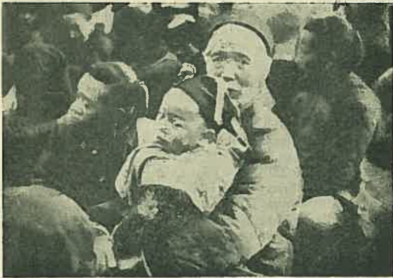
NONE TOO OLD AND NONE TOO YOUNG TO LEARN DEMOCRACY

In the winter and spring of 1942-1943, in China's sixth year of war, her third year of strength-sapping internal friction, and her second year of being almost totally cut off on land and sea, all