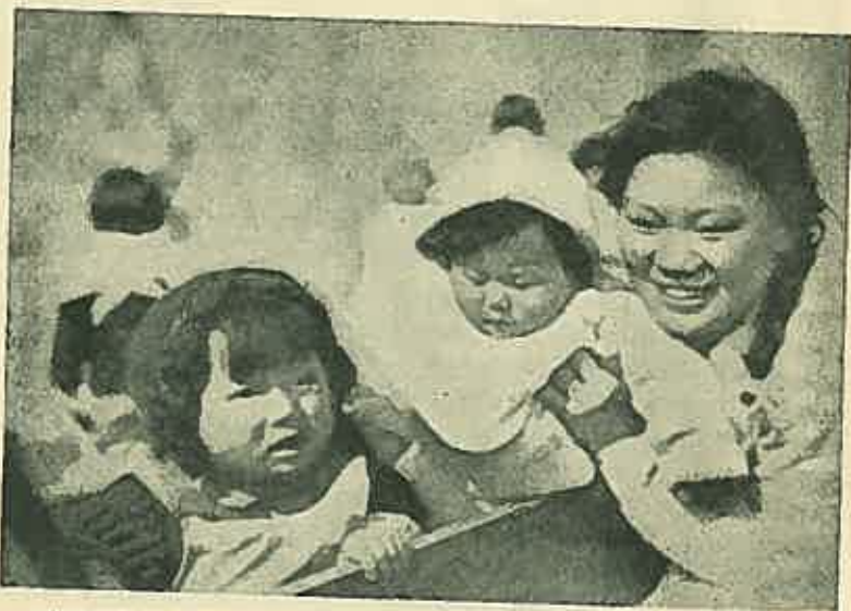
VITAMIN D INTAKE — NURSERIES STRESS SUNLIGHT AND FRESH AIR

The children live in clean, well-ventilated caves that open out on broad terraces facing south. They work and play outdoors as