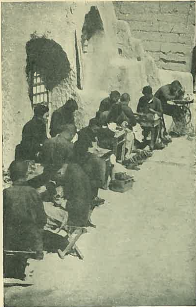
SHOEMAKING COOPERATIVE — INDUSTRIES ARE DECENTRALIZED