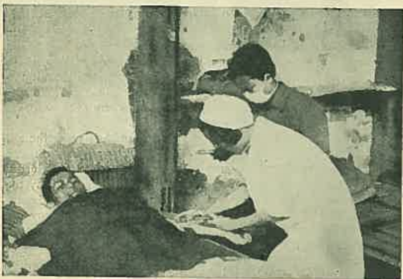
FIELD HOSPITAL IN A CONVERTED TEMPLE

Malnutrition is general in these regions, and is recognized as the chief predisposing cause of diseases suffered by both soldiers and civilians and the slow recovery from even minor ailments and