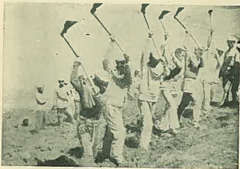
CULTIVATION, REHABILITATION — BUILDING UP A FOOD RESERVE

In the 29 guerrilla districts of Honan the people are staying home and facing a greater battle than they fought last year. They hold two coincident fronts—against hunger and the Japanese. Either of these enemies can defeat Free North China and conquer the bastion that for six years has flown the banner of the people's war behind Japanese lines. To survive, it must defeat both enemies. And to defeat these enemies it must have help.