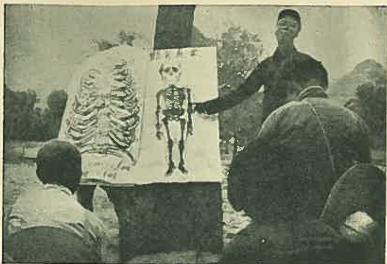
ANATOMY LECTURE, GUERRILLA STYLE

up to his death, and 15 other International Peace Hospital staff physicians, serves as the faculty. The staff has recently established a Medical Advisory Board. Its function is to give advice on technical matters to various health departments and individual doctors, to carry on research in local problems, and to publish a journal to educate medical workers throughout the Shansi-Chahar-Hopei Border Region.