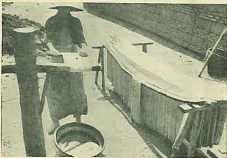
NORTHWEST TEXTILE COOPERATIVES ARE GEARED FOR WAR

This was not to be the case. No news came of the retaking of the lost territory, traitors were working actively, and bandits and hungry stragglers ravaged the countryside. Since measures had to be taken for self-protection, the cooperators armed themselves with whatever weapons they could find, and organized a Kung Ho Self-Defence Corps. Soon realizing they would be annihilated unless they took more positive steps, they decided to move north to work under the protection of the Eighth Route Army. Discarding extra clothes, cutting down food to a minimum and travelling only by night they reached the Shansi-Honan-Hopei