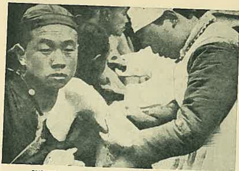
EPIDEMIC PREVENTION — AN IMPORTANT MILITARY OBJECTIVE

sodium glycerophosphate and tryptaflavin for injection, iron-arsenic, quinine, scopoline, sodamint, mercury chloride, salmlax and other tablets, and several types of tinctures. More than 20 compounds are manufactured in the Department of Chinese Medicine.