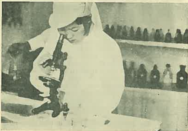
SCIENCE VS. SUPERSTITION