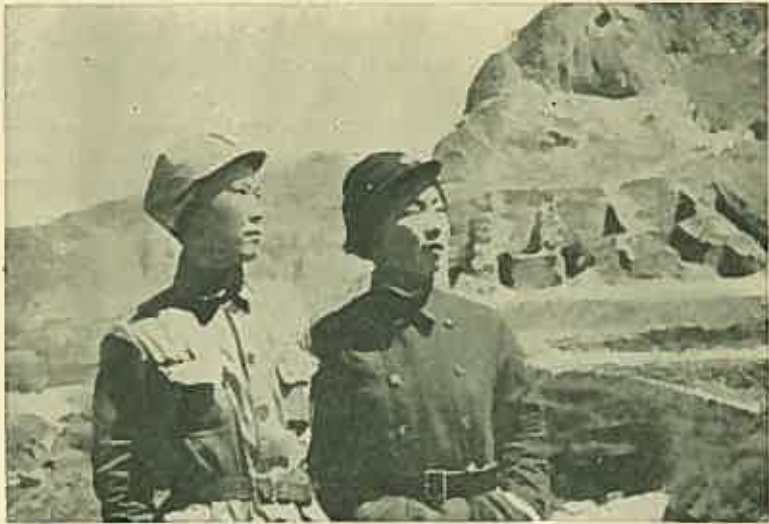
GUERRILLA WOMEN LEAD IN "TOTAL RESISTANCE" TO THE ENEMY