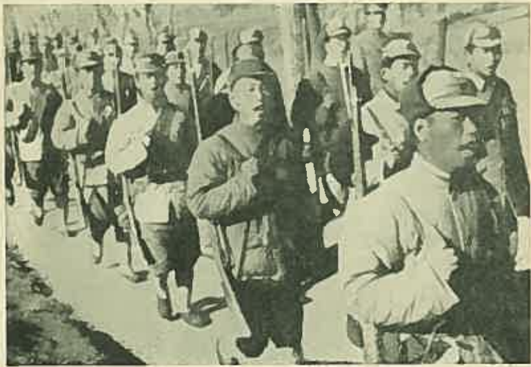
GUERRILLA MEN DEDICATE THEIR LIVES TO THE FOUR FREEDOMS