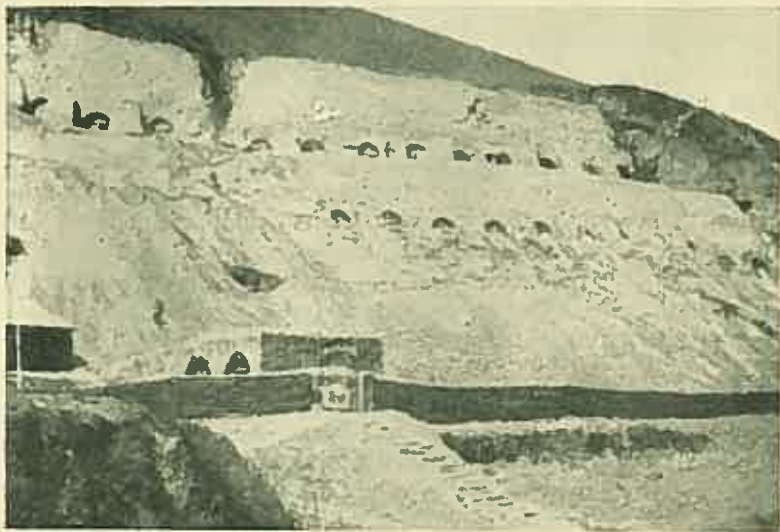
BOMBPROOF BASE HOSPITAL FOR GUERRILLA SICK AND WOUNDED

These hospitals, established and maintained mainly by funds from the United States, Canada, and England, are located at strategic points in the so-called "Border Regions." Contingent to and behind enemy lines, these regions comprise approximately 600,000 square miles of territory recaptured from the Japanese by Chinese guerrillas in some of the bitterest campaigns of the war. Although the Japanese control the principal cities and communication lines, the vast stretches of countryside lying between the captured points are firmly held and defended by guerrillas. Under their leadership, some 52,000,000 Chinese living in the Border Regions are organized for total mass resistance and participate in local democratic governments of their own making. For nearly seven years, armed almost entirely with material taken from the enemy, they have immobilized more than 60 percent of the total number of Japanese troops in China and accounted for 40 percent of the enemy's casualties.