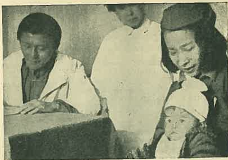
CHILD CARE CLINIC: HEALTH FOR GUERRILLA WAR BABIES

6. Emergency Clinic: Doctors in charge of the various Out-patient Department clinics are on call for servicing this department, and 12 internes from Yenan Medical University are constantly attached to it. Cases of all kinds are handled.