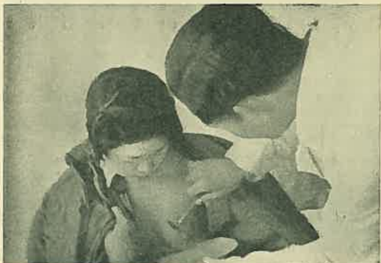
OUTPATIENT CLINIC: BREAST ABSCESS DRESSING