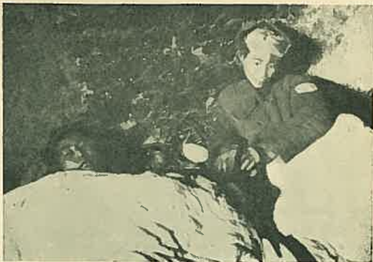
REFUGEE AND WOUNDED GUERRILLA SHARE IN RELIEF MEASURES