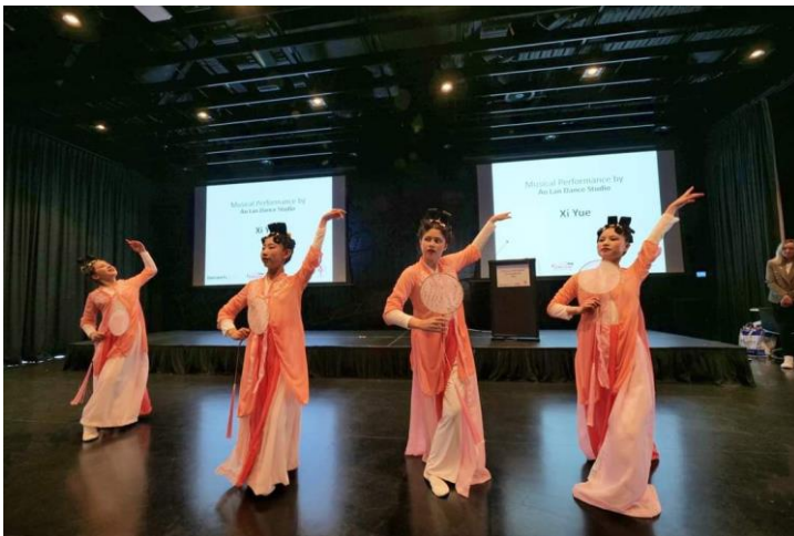
Dance: Xi yue