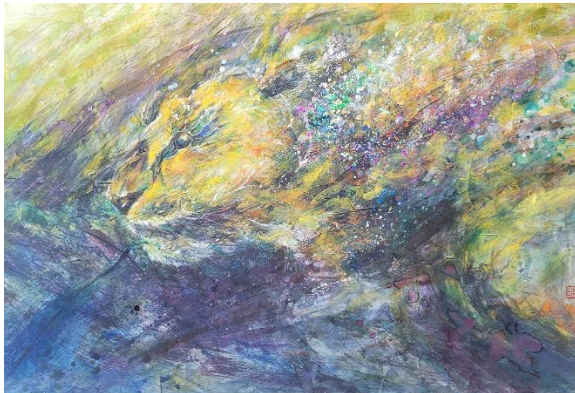
Look closely; you might see a tiger...