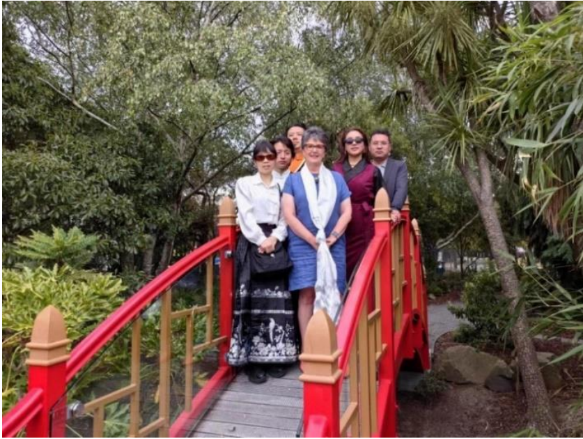
Hurunui Mayor Marie Black with delegation members at the Amberley Chinese Garden.