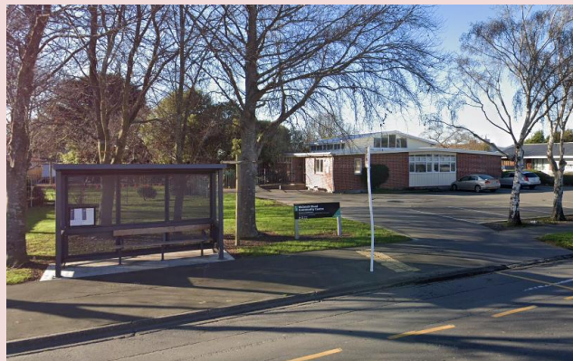
Waimairi Road Community Centre 166 Waimairi Rd, Ilam

Please remember we have a new meeting site; easy access, good parking